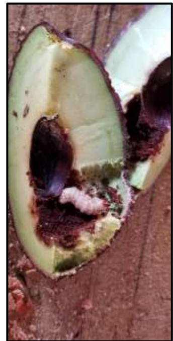
Hass fruit with H. lauri larva feeding inside seed

Program for H. lauri : In response to the invasion threat posed by H. lauri to the California avocado industry a proactive