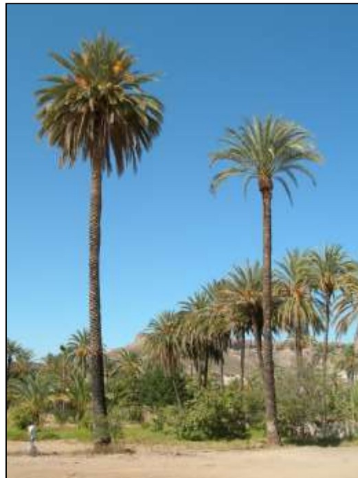
Figure 2. Old date palms at the oasis of La Purísima, Baja California Sur, Mexico. These trees are climbed with only a climbing belt once a year to harvest fruit.