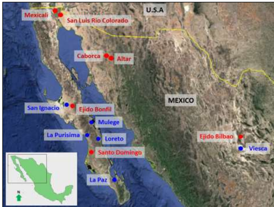
Figure 4. Date production areas in Mexico. Areas in red grow high value commercial cultivars; areas in blue cultivate criollo dates.