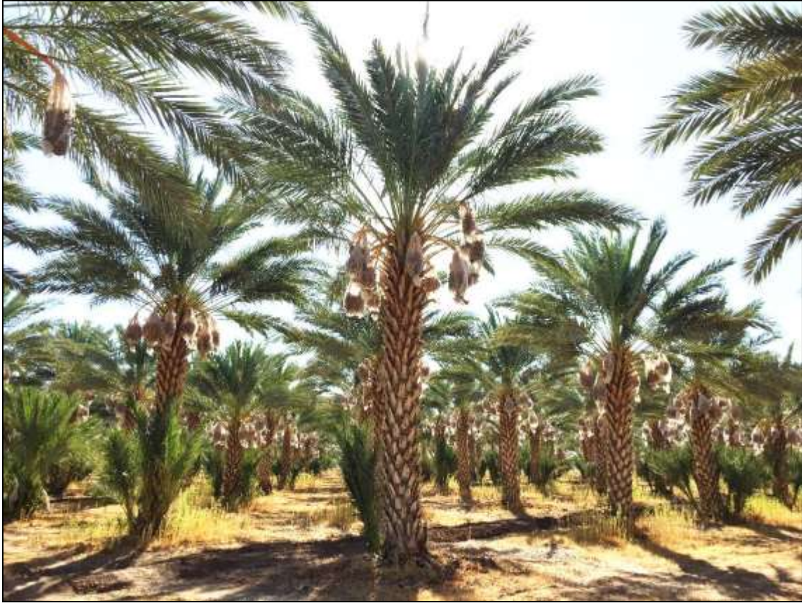
Figure 3. Modern industrial date palm plantation in Mexicali Valley, Baja California, Mexico.

Modern date cultivation in Mexico arose independently from the traditional oases date culture. By the end of the 1960's, date cultivation had been established in the San Luis Rio Colorado Valley in the State of Sonora using offshoots imported from Yuma, Arizona. Commercial date plantations were subsequently established in the nearby Mexicali Valley in the State of Baja California (Figure 3) and in other areas of Sonora such as Caborca and Altar. There is also a small production area in the State of Coahuila comprising Ejido Bilbao and Viesca (Figure 4).