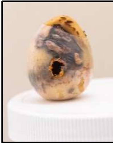
A hole in an avocado seed from which an adult H. lauri emerged

into the seed to feed causing significant internal damage. Mature avocado seed weevil larvae pupate in the seed. Following pupation adults use their mandibles, located on the end of the rostrum, to chew a large circular exit hole to escape from the pupation chamber. Internal feeding by larvae damages fruit, making it unmarketable, and in some instances heavy damage causes fruit to drop prematurely. In parts of Mexico, H. lauri is a significant pest of Hass avocados. Around 60% of Hass fruit have been reported as being damaged by H. lauri in unmanaged orchards in Morelos, Mexico (Medina 2005). In Colombia, damage levels in heavily managed Hass orchards range ~4-8% (Caicedo et al. 2010).