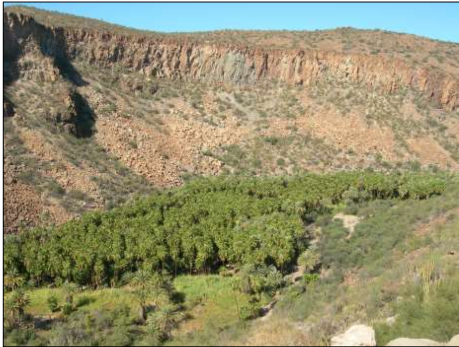
Figure 1. The oasis of San José de Comondú, Baja California Sur. Date palms and Washingtonia fan palms intermingle in the oasis.

The cultivation of the date palm was introduced to the central part of Mexico in the mid-sixteenth century by the Spanish colonizers. However, due to climatic factors, that area of Mexico was not suitable for the production of dates. The Jesuit missionaries established settlements known as missions in 15 places on the Baja California Peninsula, chiefly in areas belonging to the present State of Baja California Sur, where dates can reach maturity, producing a viable crop in these areas. During the colonization process, which lasted from the late sixteenth to the mid-seventeenth centuries, various date palm plantations were established in oases areas, and some of them have survived to this day (Figure 1). The oases, which supported the native Washingtonia fan palms, were suitable for date production not only due to the climate, but also to the presence of high levels of soil water. Both Washingtonia palms and date palms require high amounts of soil moisture for vigorous growth and, in the case of the date palm, acceptable fruit development.