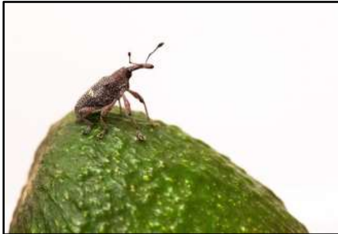
Heilipus lauri , the avocado seed weevil

An Identifiable Invasion Threat – Heilipus spp. Weevils: Currently, California-grown avocados are free from specialist fruit feeding pests such as seed feeding weevils (e.g., Heilipus lauri .) and moths (e.g., Stenomoma catenifer ). Larvae of these pests bore into fruit to reach the seed. Establishment of these fruit feeding pests in California would cause significant disruption and threaten the long-term economic viability of this industry (Hoddle 2006).