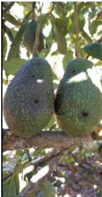
Hass fruit with oviposition holes made by H. lauri

Control Options: Chemical control is difficult because larvae are protected within fruit (Caicedo et al. 2010). Cultural control (e.g., removal of infested fruit and branches) and trapping using black pyramidal interception traps (i.e., Tedders traps) that serendipitously catch motile weevils are ineffective for suppressing pest populations to non-damaging levels (Vallejo et al. 2014). The natural enemy fauna, especially the identity of parasitoids, attacking weevil eggs, larvae, and pupae is not well documented and natural enemy impacts need quantification (e.g., life table studies) (Caicedo et al. 2010; Castañeda-Vildózola, et al. 2017).