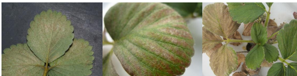
Twospotted spider mite damage. Browning (left two) to dying (right) of the damaged leaves.

Damage: Damage by twospotted spider mite appears as stippling of yellow spots that advances into scarring and bronzing of leaves. Severe damage stunts plant growth and can result in plant death. Fall-planted strawberries are very sensitive to mite damage within 2 to 5 months after transplanting. Infestation of more than 1 mite per leaflet can result in measurable yield reduction during this period. Plants are less sensitive to mite damage after initial berry set. However, substantial losses can occur with 15-20 mites per mid-tier leaflet during this period. Highest infestations can be seen after peak spring harvest after which populations rapidly decline. Damage symptoms of Lewis mite on strawberries are yet to be determined.