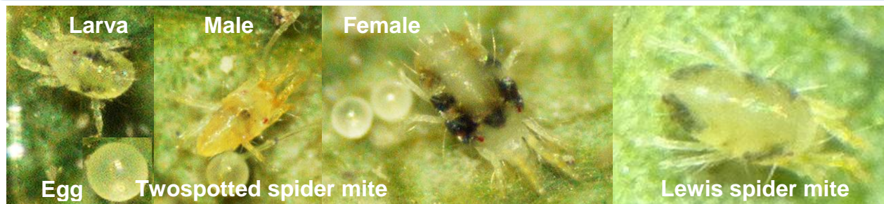
Twospotted spider mite life stages and Lewis spider mite adult (extreme right).

Strawberry and Vegetable Crops Advisor, UC Cooperative Extension, San Luis Obispo, CA 93401 Email: skdara@ucdavis.edu Phone: 805-781-5940